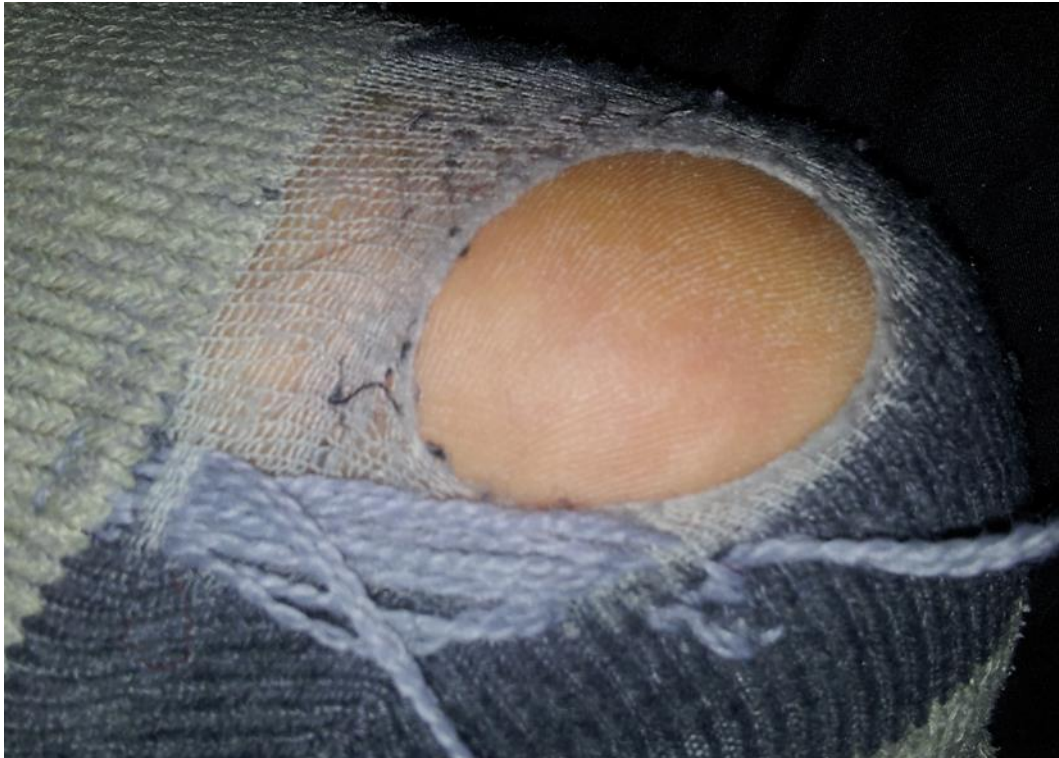
Photo 1: Hole in Sock. I repaired the hole using darning wool purchased online.