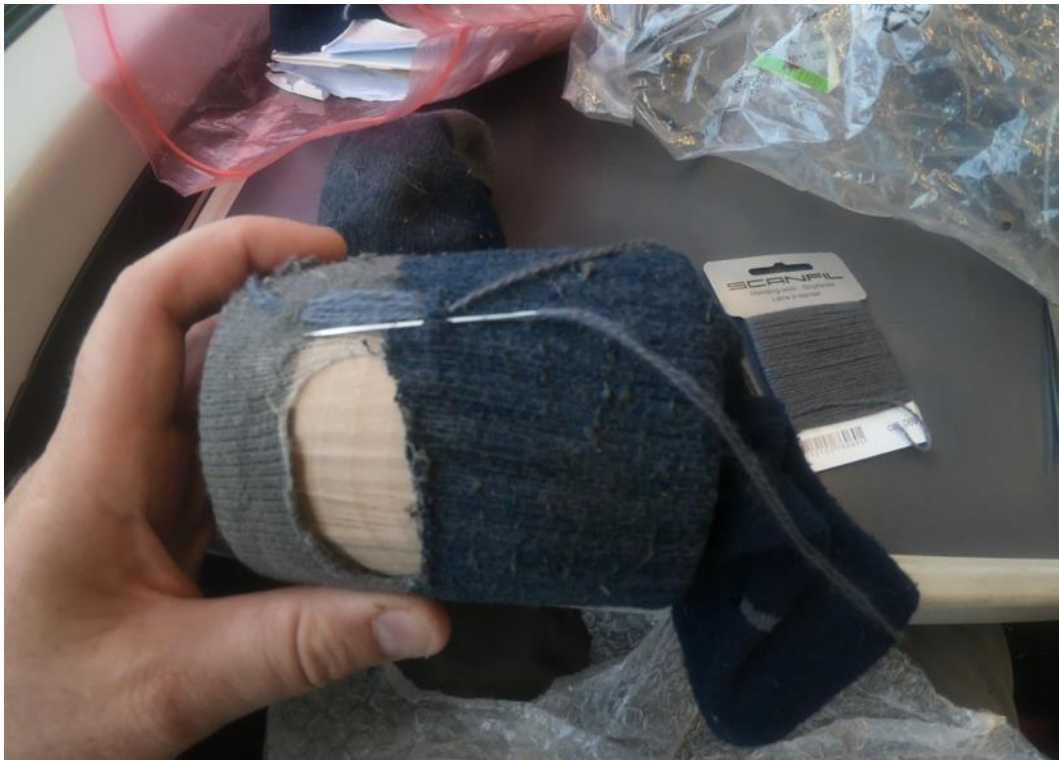
Photo: 3: Various videos on U-tube (e.g. https://www.youtube.com/watch?v=NDkMShaLX9c ) demonstrate the technique which is a great life-skill to learn.